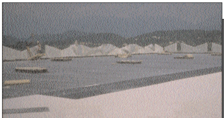
Split-slab Plaza Deck Installation