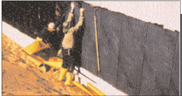
Below-grade Concrete Wall Installation

To ensure maximum waterproofing protection, use Aquadrain® prefabricated drainage composite in conjunction with Envirosheet waterproofing.