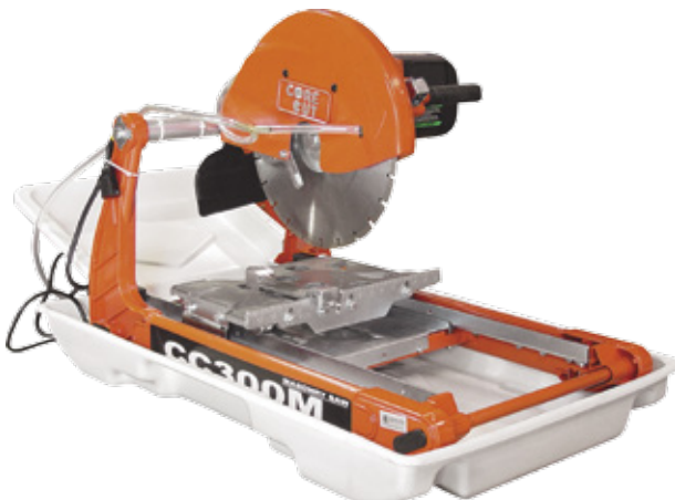
CC300M with Wet Cut Kit