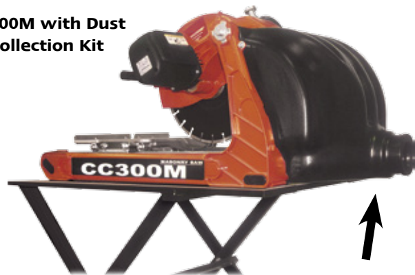
CC300M with Dust Collection Kit

Connects to most shop vacuums, our pro collection vac and dustless systems